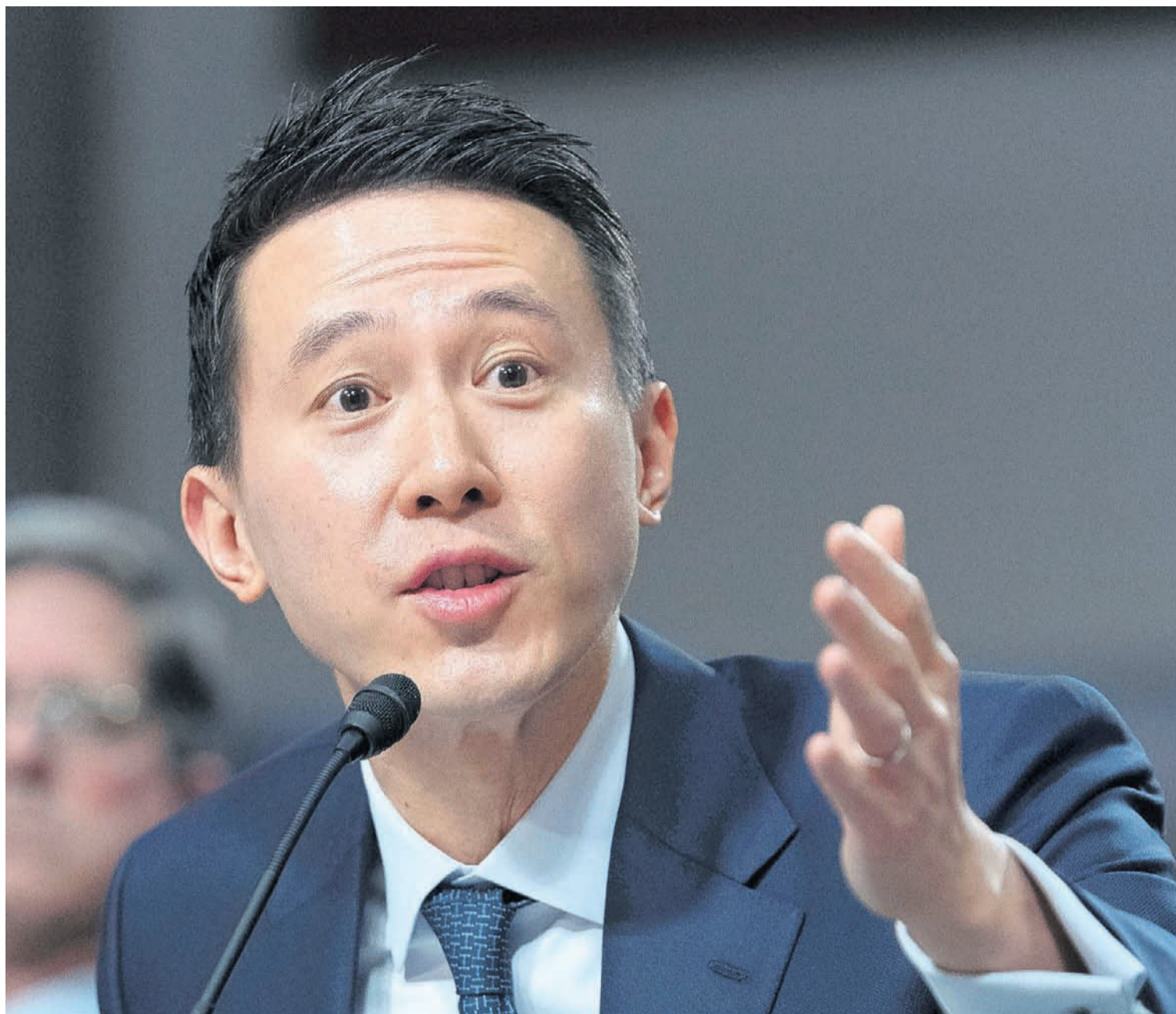
TikTok CEO Shou Zi Chew testifies on Capitol Hill in Washington, Jan. 31, 2024.